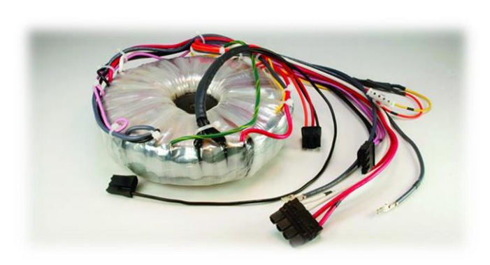
Toroidal power transformer for surgical imaging application

This toroidal transformer was designed to meet the demanding needs of medical imaging. Custom designed and manufactured specifically for a demanding application, this toroid includes value-added components such as connector harnesses and application-specific packaging and shielding.